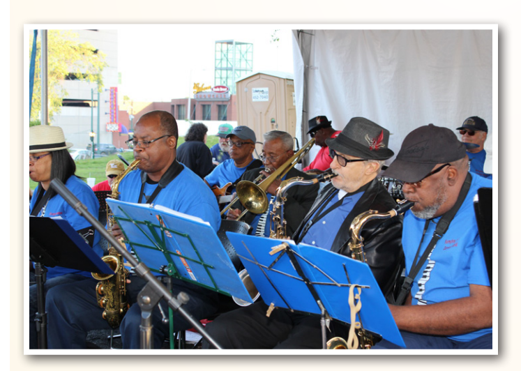
Plus-1 Jamming: Delivering the mail? The Letter Carriers are a band of U.S. Postal Service employees who love to play music, especially for Plus-1 Jam.